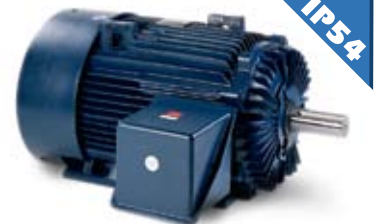
Blue Chip XRI® - Severe Duty ⊕ Meets NEMA Premium® Levels