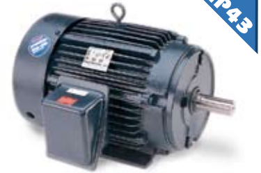
Blue Chip XRI® - Ultra High ⊕ Meets NEMA Premium® Levels