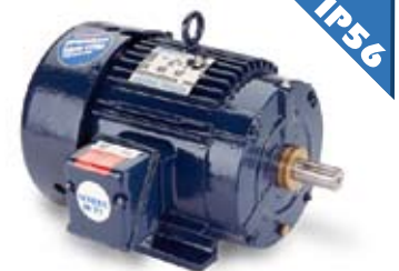
Blue Chip XRI®-841 Meets IEEE 841 Motor Specifications ⊕ Meets NEMA Premium® Levels