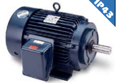
Blue Chip® Meets EPACT and Canadian NRCAN